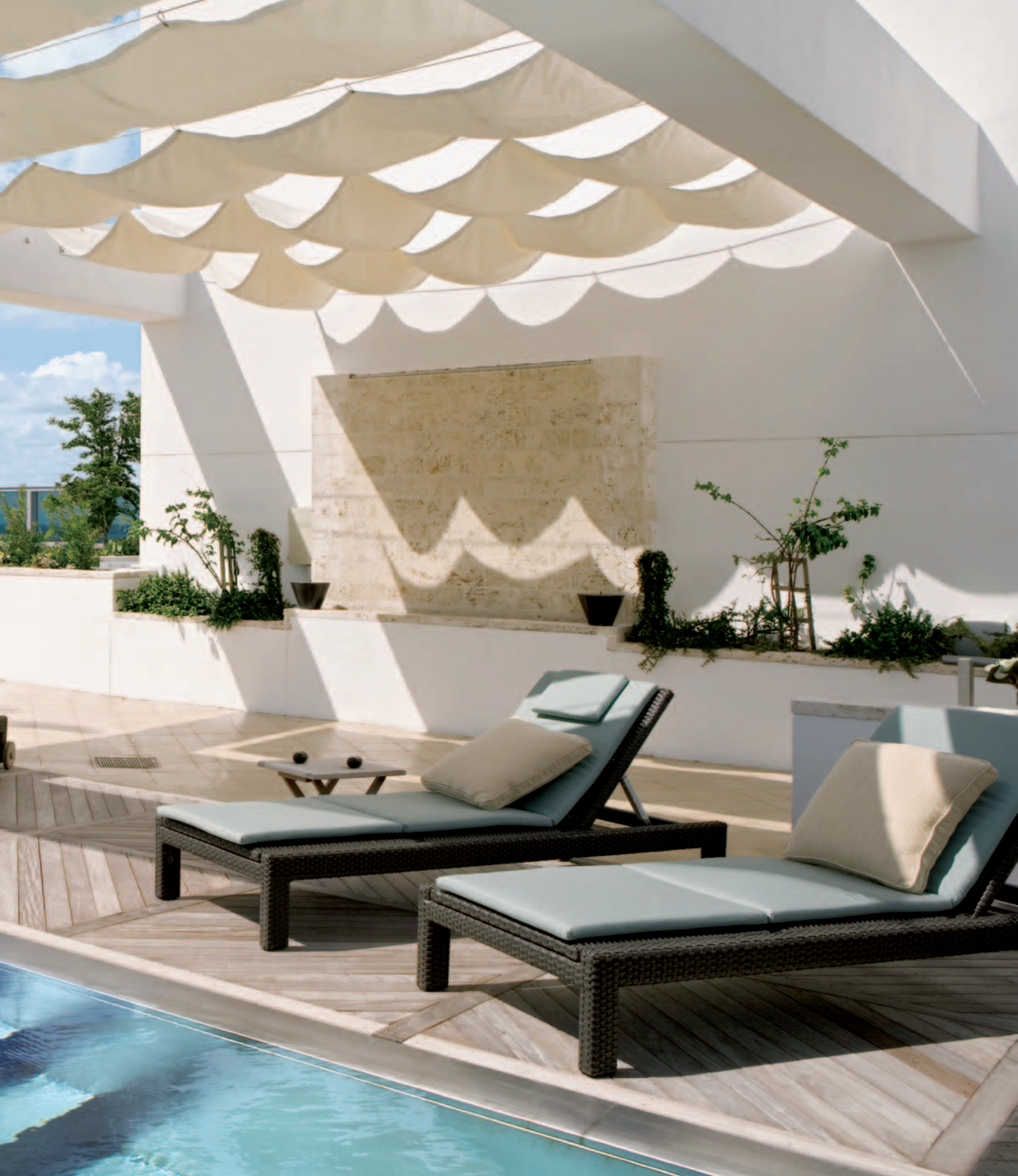
ABOVE: The architectural team custom designed adjustable canopy sails that provide privacy and shelter from the sun on the rooftop terrace — making it ideal for photo shoots and gala events, such as last year's MTV Music Awards party. The penthouse and terrace can be rented for $25,000 per night.