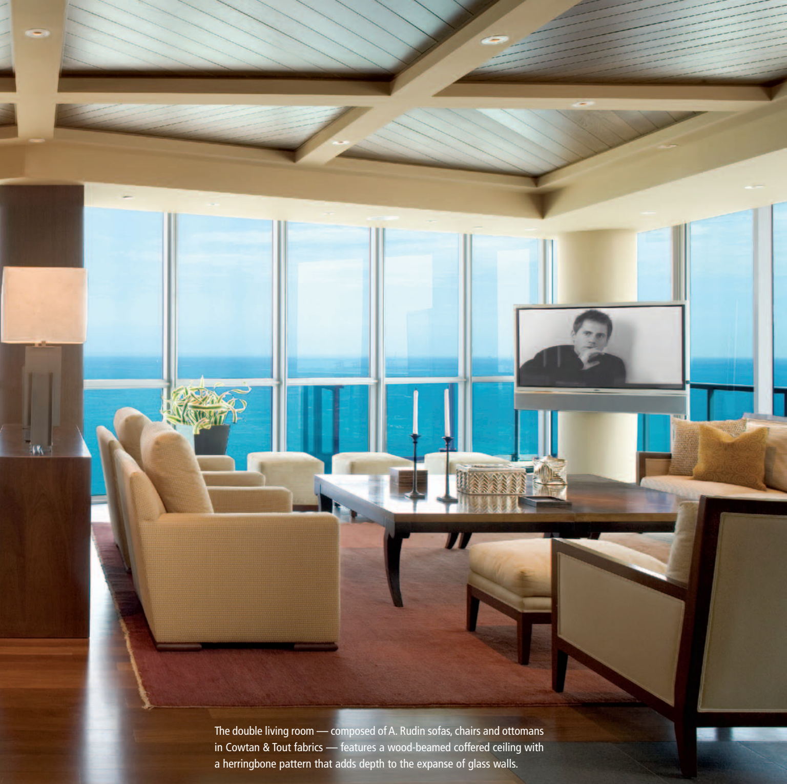
The double living room — composed of A. Rudin sofas, chairs and ottomans in Cowtan & Tout fabrics — features a wood-beamed coffered ceiling with a herringbone pattern that adds depth to the expanse of glass walls.